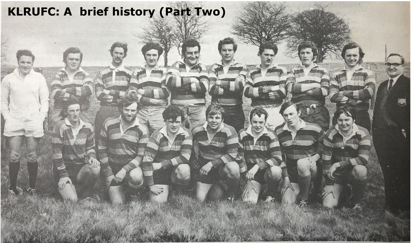
Kirkby Lonsdale 1971 — Westmorland Cup Winners